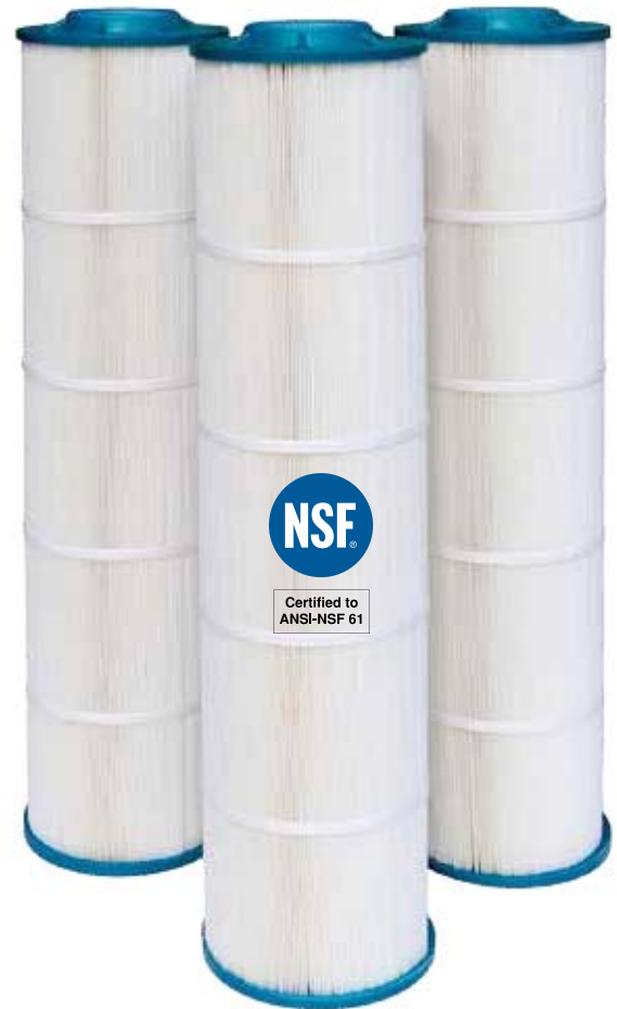
Pleated Microglass Cartridges